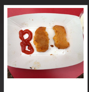
photo contest for the Fair. To enter, fairgoers had to arrange food items to spell out 8-1-1 and post it to a social media account using #iowaonecall. We received some very creative posts, and winners were selected daily.

It's no secret that the Fair thrives on deep-fried food, and many of these items are on a stick or in circular form. This year, lowa One Call introduced a